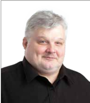
AerOceaNetwork's Executive Director

I have some good news for you. No, strike that. I have some great news for you!