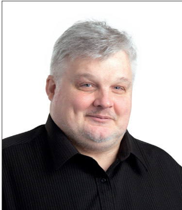
AerOceaNetwork's Executive Director

I am very happy and excited to be going back to Panamá! Panamá is one of my favorite places around the world. I have been to Panamá in the past and have thoroughly enjoyed my time there. The culture, the atmosphere, the food, the night life, the people... Panamá is a great place to have an international freight forwarders' meeting.